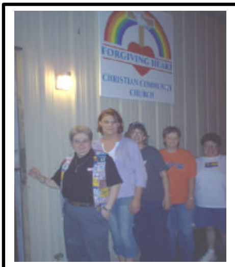
The New Place!