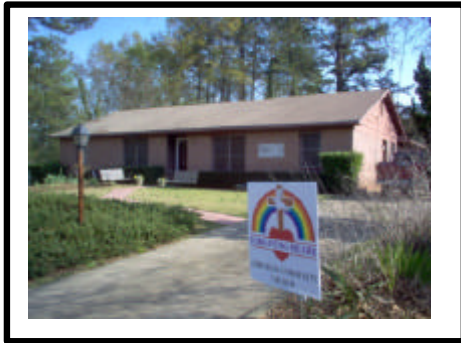
The old church